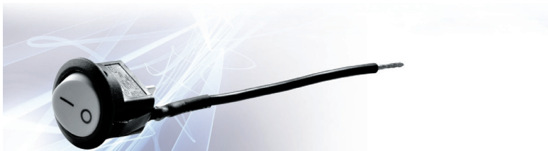
▶ Switch with lead wire